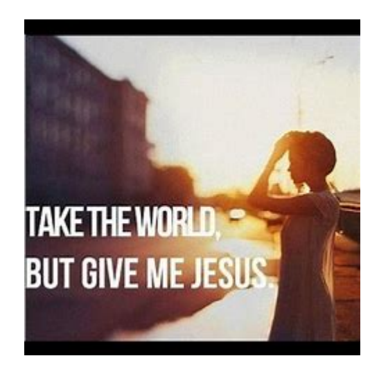
Take the World, But Give Me Jesus

<sup>11-13</sup> All this is proceeding along lines planned all along by God and then executed in Christ Jesus. When we trust in him, we're free to say whatever needs to be said, bold to go wherever we need to go. So, don't let my present trouble on your behalf get you down. Be proud!