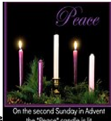
Advent / The Peace Candle

Not in that poor lowly stable, With the oxen standing by, We shall see Him, but in heaven, Set at God's right hand on high; When like stars His children crowned, All in white shall be around.