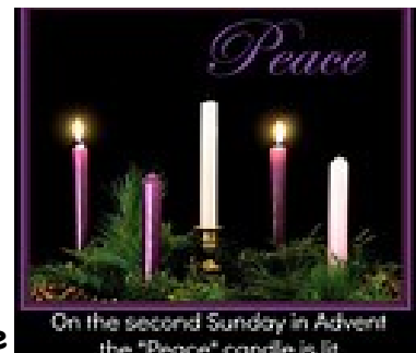
Advent/ Peace Candle

6/ Not in that poor lowly stable, With the oxen standing by, We shall see Him, but in heaven, Set at God's right hand on high; When like stars His children crowned, All in white shall be around.