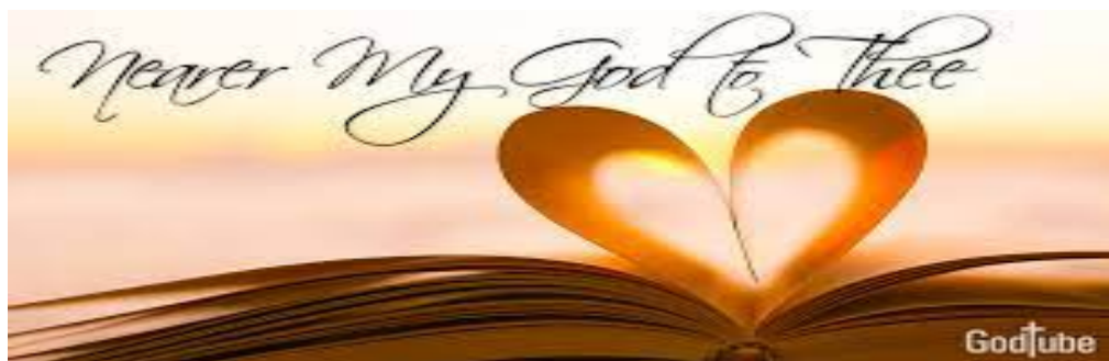
Near, my God, to thee

In the name of the Father Son and Holy Spirit Amen.