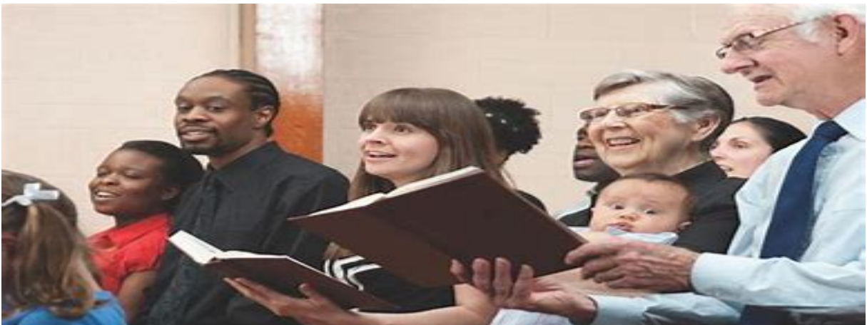
153- "Great is Thy faithfulness"

Our Father, who art in heaven, hallowed be thy name. Thy kingdom come, thy will be done on earth, as it is in heaven. Give us this day our daily bread. And forgive us our debts, as we forgive our debtors. And lead us not into temptation, but deliver us from evil. For thine is the kingdom, the power, and the glory, forever. Amen.